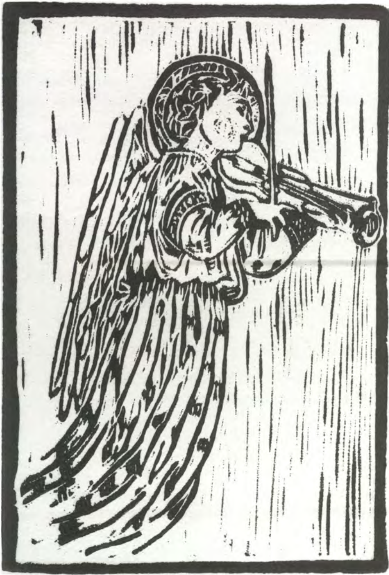
Sewanee Tsutomu Shiraki