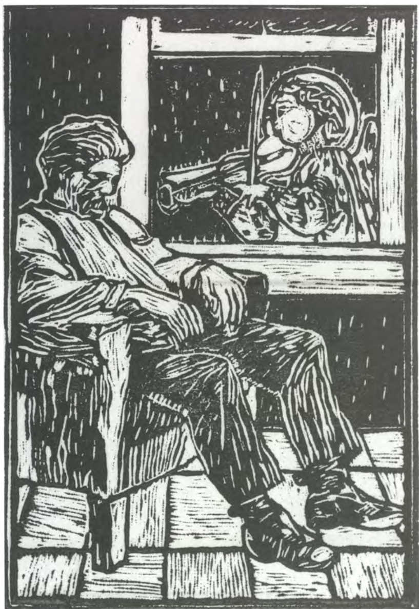
The Shadow of the Tear Tsutomu Shiraki