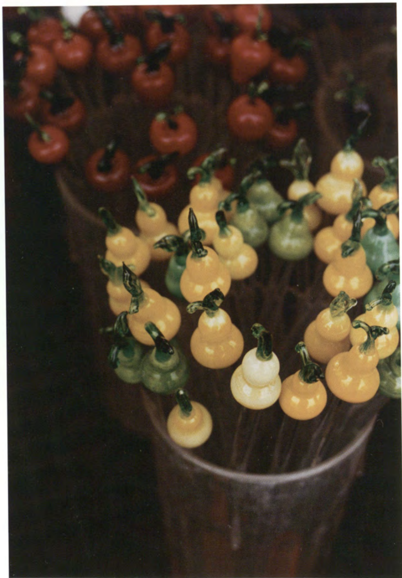
Glass Apple Pears Melanie Schaap