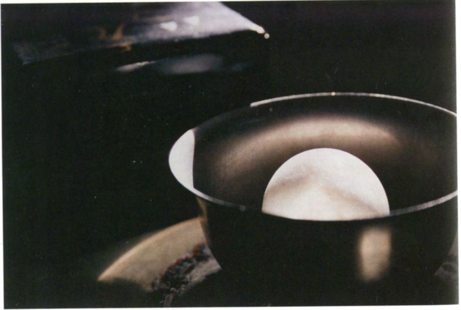
Untitled Melanie Schaap