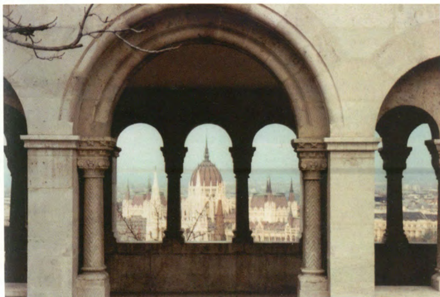
Budapest Parliment from Castle Shile Dayton