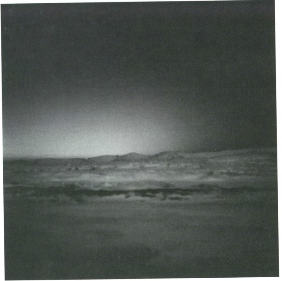
Lights of Chicago Kathleen North